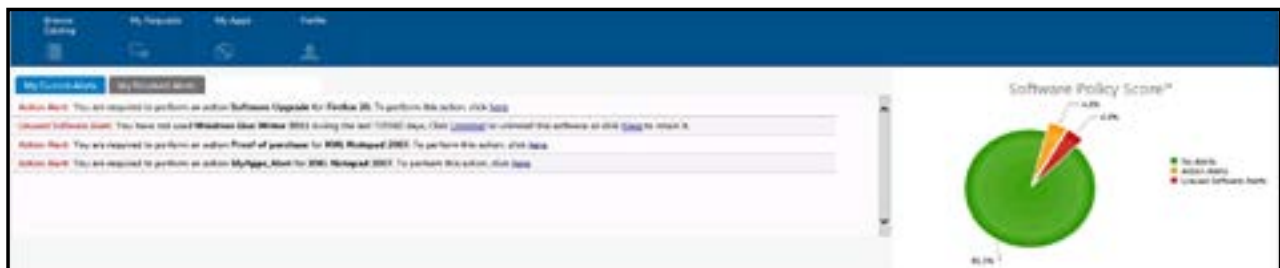
Figure 2: My Apps offers employees one place to view how applications installed on their devices comply with corporate policies and to participate in Software License Optimization.

Software Policy Score™ — A metric, displayed as a pie chart, that indicates how closely applications on the user's devices comply with defined policies. Users can keep their score green by aggressively resolving the policy alerts they receive, such as removing unused applications or providing proof of purchase for unlicensed software. This unique feedback mechanism enables IT to engage users and encourage them to be good corporate citizens, making them part of the solution rather than part of the problem.